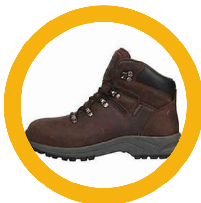
Wellingtons and walking boots