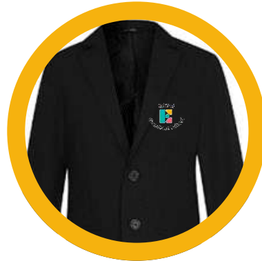
School blazer or jumper