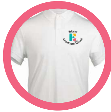
School polo shirt or buttoned shirt