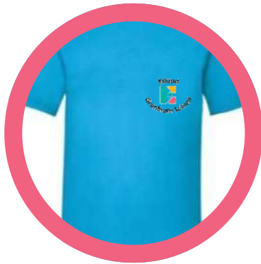
Azure logo T-shirt