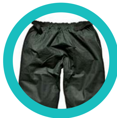
Waterproof coat and leggings.