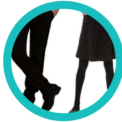
Black trousers / skirt