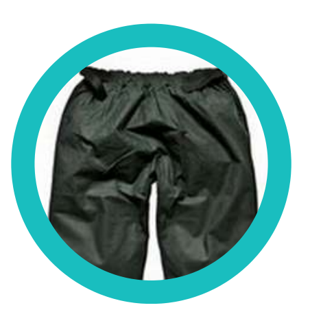
Waterproof coat and leggings.