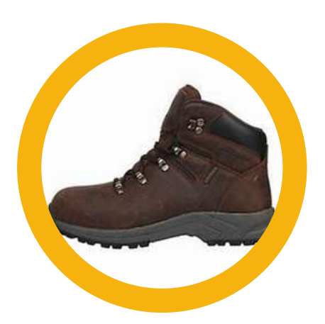
Wellingtons and walking boots